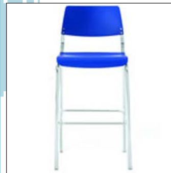
Arc Stools, Harter