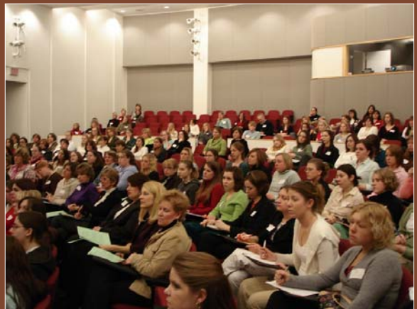
Career Day 2006