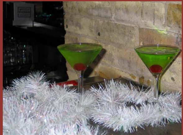
Madison's Club Was shakin' Up A Special IIDA Martini for IIDA-WI's Retro Party in January.