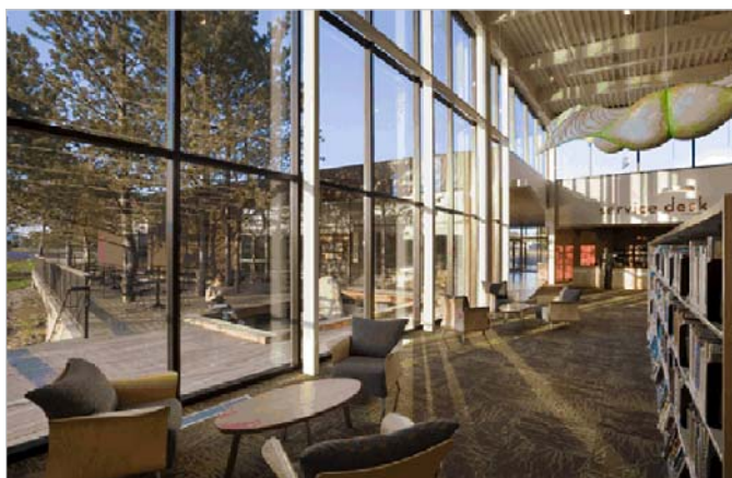
Best of Competition, Ramsey County Library.

Madison, WI-The Wisconsin Chapter of the International Interior Design Association is pleased to announce the winners of the 2008 IIDA Wisconsin Interior Design Competition. The awards were presented at Celebrate 2008 In Design, which was held at the Madison Club on May 1, 2008. The winners received an engraved crystal globe and stand.