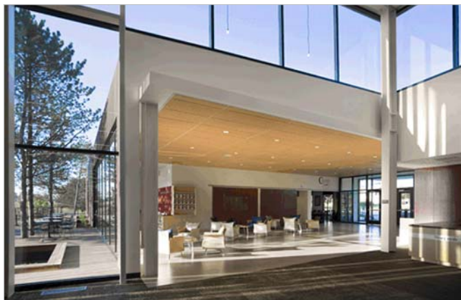
Best of Competition, Ramsey County Library.

Thank you to all of the IIDA members who submitted their work. The projects represent outstanding examples of the design work that is being done by professional interior designers.